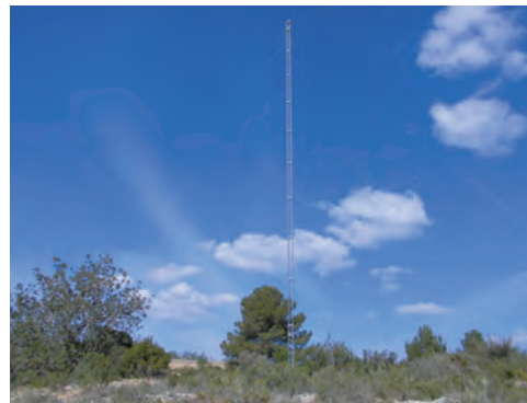
Delta antenna for the HF communication in the ionospheric station of Roquetes, Spain

ware and hardware tools necessary for implementing communication protocols suited for a reliable and interoperable Short Wave (High Frequency) radio network back up. To meet the above mentioned objectives the main activities concern the designation of ECIs in the regions of interest and the analysis of potential communication problems among them, followed by the identification of the most suitable topology for a high survival radio communication network. Moreover, SWING has to determine the criteria for early warning alerts, the procedures to activate the backup network, as well as the minimal amount of information necessary to maintain control over ECIs keeping them lin-