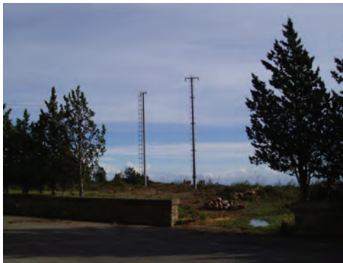
Rhombic antennas for the HF communication in the ionospheric station of Gibilmanna, Italy

SWING (Short Wave critical Infrastructure Network based on a new Generation high survival radio communication system) is an European project aimed at studying a high survival HF radio network to link European Critical Infrastructures (ECIs).