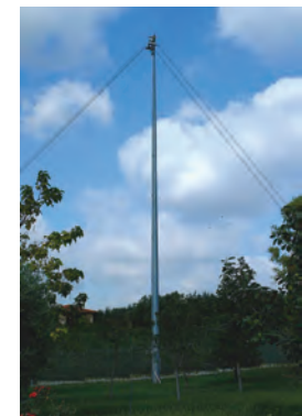
Delta antenna for HF communication in the ionospheric station of Rome, Italy

teristics in order to manage the transmission frequencies of the HF network. The activities are distributed among four Co-Beneficiaries (INGV-Italy, CNIT-Italy, NOA-Greece, OE-Spain). An experimental network is realized in the indicated place shown in the figures.