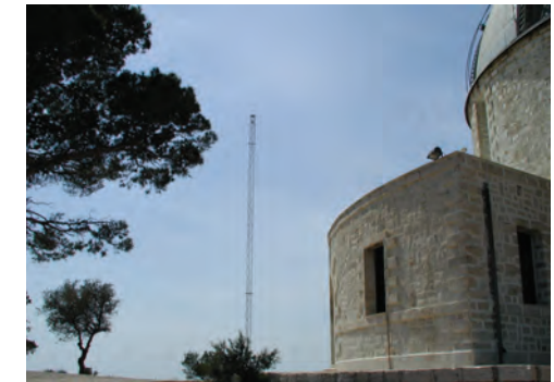
Digisonde antenna system of the ionospheric station in Athens, Greece

HF radio network, keeping into account the existing HF network communication protocol and architecture. Since the network can use both the ionospheric channel and, if required, the ground wave propagation, SWING also studies the ionospheric channel charac-